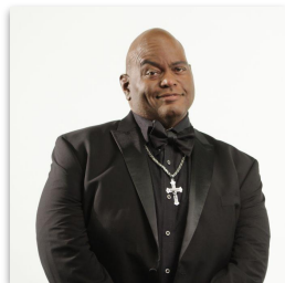
Lavell Crawford Grammy-Nominated Comedian & Actor

Click to view episodes featuring the following guests