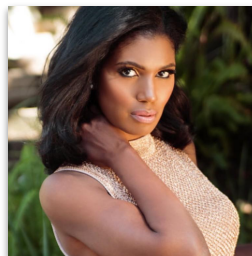
Denise Boutte Tyler Perry's Meet The Browns & Why Did I Get Married?